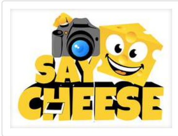
Photo Day - Friday October 14th

Individual photos will be taken next Friday morning. There will be no pre-ordering of photos . Each student will receive proofs in a few weeks and then parents can order online.