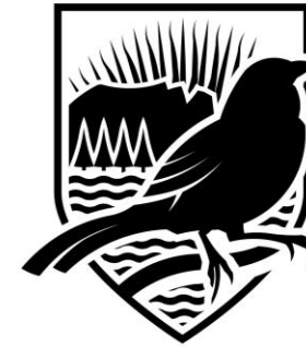
Georges P. Vanier Secondary School