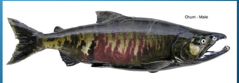
Chum - Male