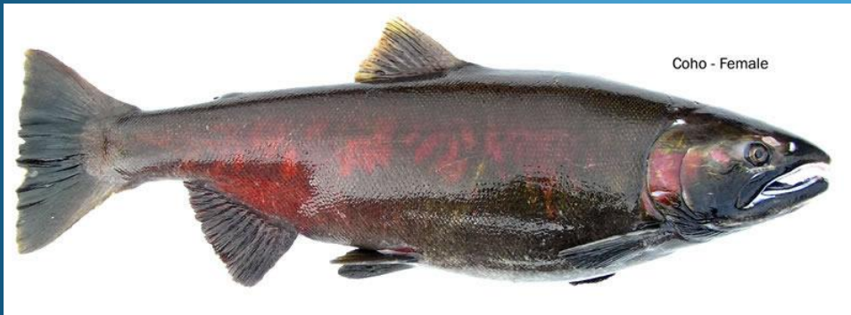
Coho - Female