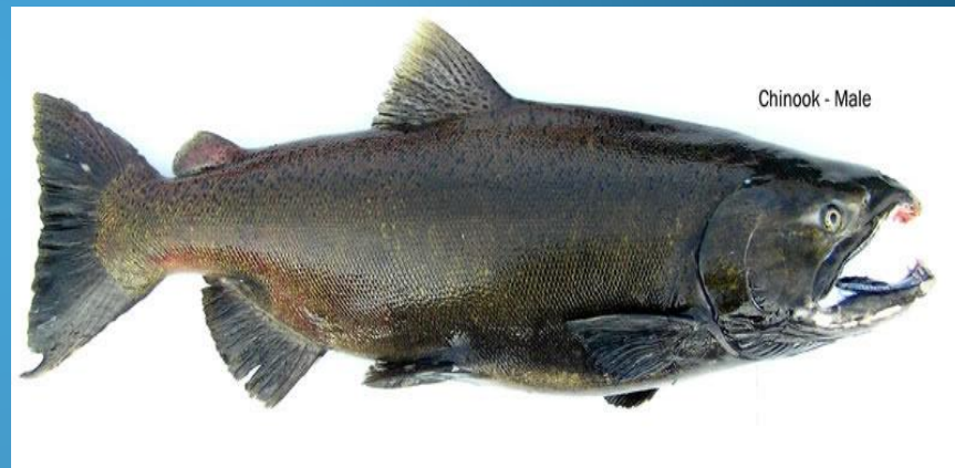
Chinook - Male