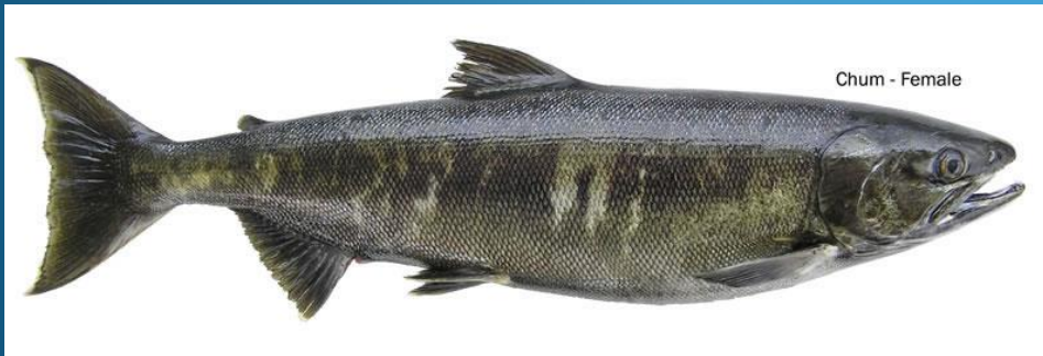
Chum - Female