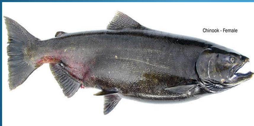
Chinook - Female