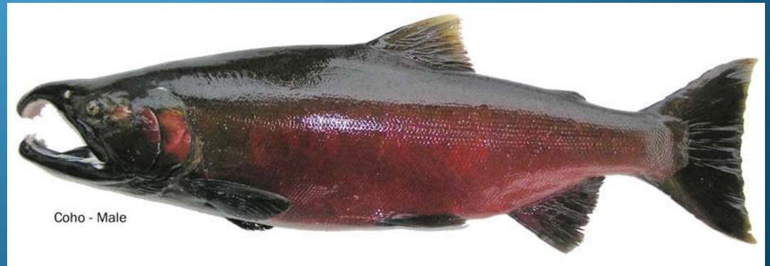
Coho - Male