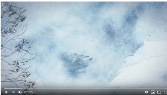
"The Stranger" Official Video - Gord Downie - Secret Path

Today's Learning Intention: I can learn about the importance of identity and what is important about yourself that you would like others to know.