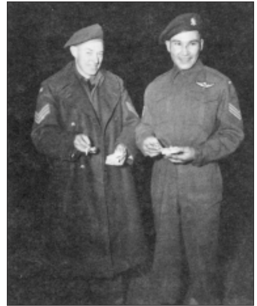
PRINCE (RIGHT) WITH HIS MM. THE SERGEANT WAS ALSO AWARDED THE AMERICAN SILVER STAR FOR DISCOVERING, AND LEADING THE BRIGADE TO, AN ENEMY ENCAMPMENT AREA.

When the fighting in Southern France was over, Prince was summoned to Buckingham Palace, where King George VI decorated him with both the MM and, on behalf of the president of the United States, the Silver Star with ribbon. Tommy Prince was one of 59 Canadians who were awarded the Silver Star during the Second World War. 71 Only three of this group also possessed the MM.