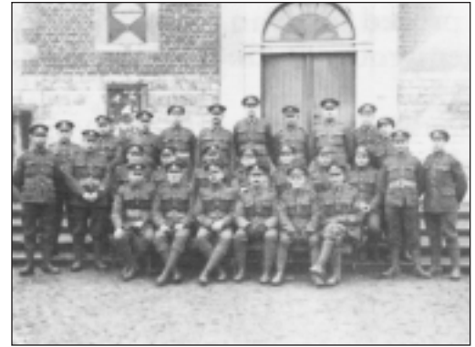
PEGAHMAGABOW SERVED OVERSEAS FOR ALMOST THE ENTIRE WAR AND REMAINED IN EUROPE AN ADDITIONAL FIVE MONTHS AFTER THE ARMISTICE. BACK HOME, HE WOULD JOIN THE MILITIA. HERE PEGAHMAGABOW'S FELLOW NON-COMMISSIONED OFFICERS OF THE 1ST BATTALION POSE TWO MONTHS AFTER THE END OF THE WAR (HE IS NOT IN THE PICTURE BECAUSE HE WAS IN ENGLAND RECEIVING MEDICAL TREATMENT AT THE TIME).

One of the most famous Canadian snipers in the First World War was a Métis marksman who went by the name of Henry Louis Norwest. Norwest was born in Fort Saskatchewan, Alberta, of French-Cree ancestry. In his nearly three years of service with the 50 th Canadian Infantry Battalion, the lance-corporal achieved a sniping record of 115 fatal shots. 33 The former ranch-hand and rodeo performer also merited the Military Medal and bar, making him one of roughly 830 members of the CEF to be awarded this double honour. 34