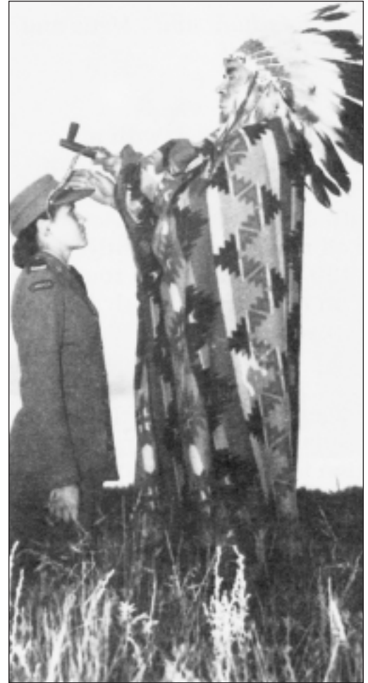
DURING THE FIRST AND SECOND WORLD WARS IN PARTICULAR, INDIAN RESERVES IN CANADA WITNESSED THE DEPARTURE OF MANY OF THEIR YOUNG ADULT MEMBERS. HERE AN INDIAN CHIEF BLESSES A NEW RECRUIT WHO IS ABOUT TO LEAVE HER RESERVE AFTER ENLISTING IN 1942, DURING THE SECOND WORLD WAR.