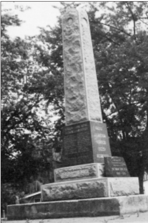
THE SIX NATIONS-MISSISSAUGA WAR MEMORIAL COMMEMORATES THE RESERVE'S VETERANS OF THE FIRST AND SECOND WORLD WARS AND THE KOREAN WAR.