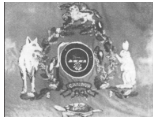
THE SIX NATIONS WOMEN'S PATRIOTIC LEAGUE EMBROIDERED THIS FLAG FOR THE 114TH CANADIAN INFANTRY BATTALION. THE BATTALION HAD PERMISSION TO CARRY IT ALONG WITH THE KING'S COLOURS AND THEIR REGULAR REGIMENTAL COLOURS.