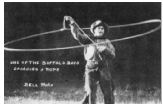
LIKE PEGAHMAGABOW, HENRY NORWEST DEVELOPED AN IMPRESSIVE REPUTATION AS A SNIPER DURING THE WAR. THE FORMER RODEO PERFORMER AND RANCH-HAND WAS CONSIDERED A HERO BY OTHER MEMBERS OF THE 50 TH BATTALION. THEY WERE STUNNED WHEN HE WAS KILLED BY AN ENEMY SNIPER THREE MONTHS BEFORE THE WAR ENDED.