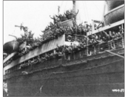
IN AUGUST 1940 THE 2 ND CANADIAN INFANTRY DIVISION SAILED FOR GREAT BRITAIN. DURING SIX YEARS OF WAR, MORE THAN ONE MILLION CANADIAN MEN AND WOMEN ENLISTED, INCLUDING AT LEAST 3,000 INDIANS AND AN UNKNOWN NUMBER OF ABORIGINAL CANADIANS WHO WERE NOT CONSIDERED STATUS INDIANS.

Many Indian bands responded to the government's declaration with protest marches and petitions delivered to Ottawa. Their members questioned their requirement to serve in this war, when they had been exempt from compulsory service in the previous one.