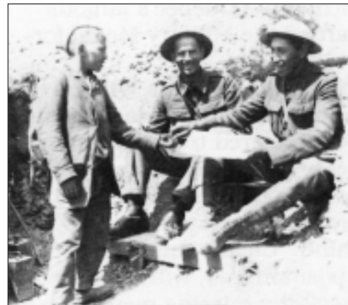
LONGBOAT WAS WOUNDED TWICE AND ONCE WAS WRONGLY REPORTED KILLED. HE WOULD SURVIVE THE WAR. HERE HE IS SHOWN BUYING A NEWSPAPER FROM A FRENCH NEWSBOY IN 1917.