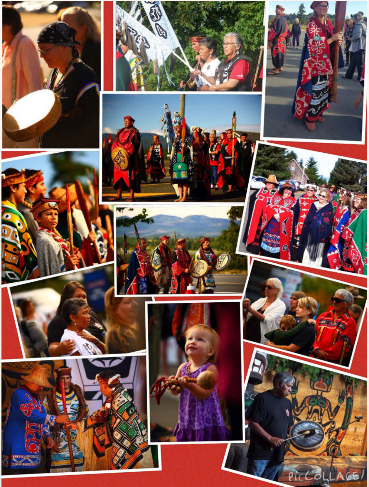
Collage courtesy of WWOS K'omoks