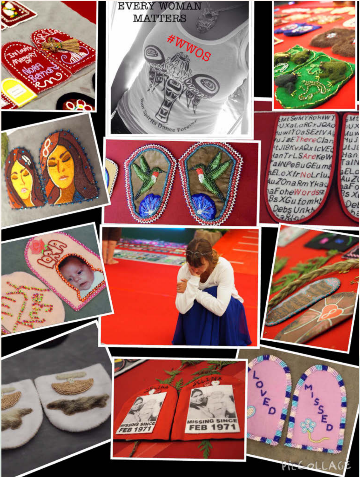
Collage courtesy of WWOS Komoks