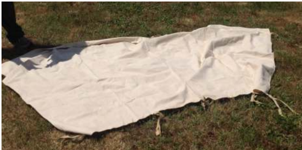
Inner wall x 2