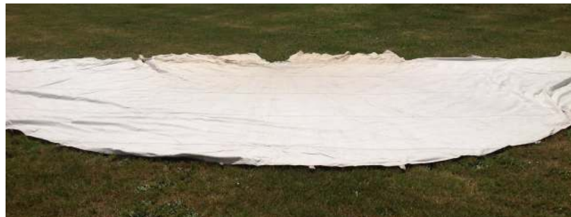
Canvas Tipi cover