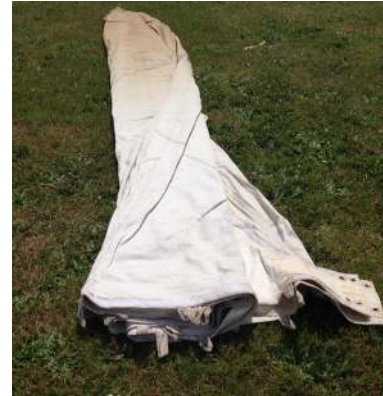
Canvas Tipi Cover