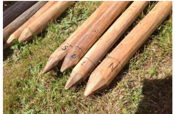
South Pole North Pole Door Pole Lifting Pole