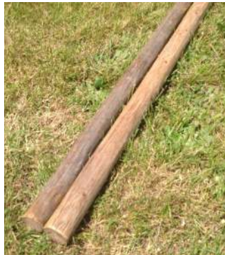
Smoke Hole Poles