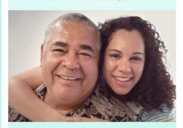
Information for Parents and Careaivers

An Attachment-Based & Trauma-Informed Program for Parents and Caregivers