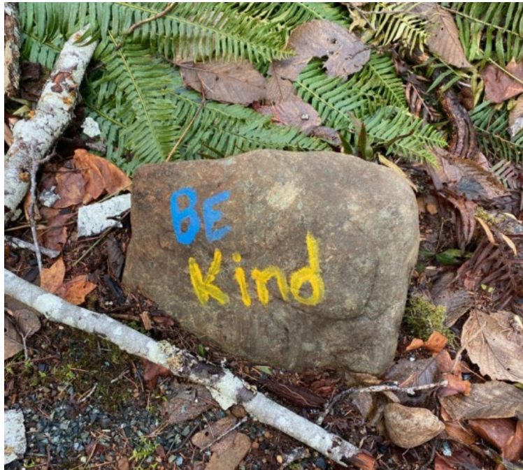
Inclusion Club Rock Painting