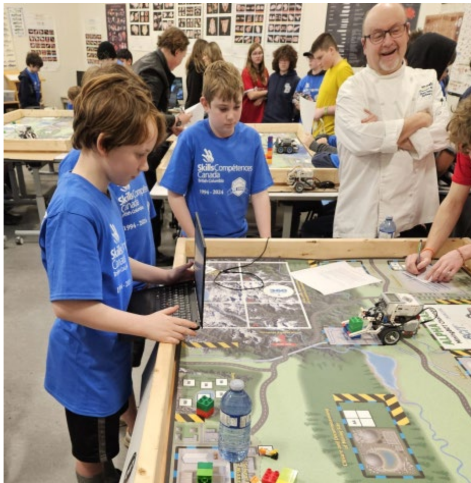
Skills Canada Students at NIC