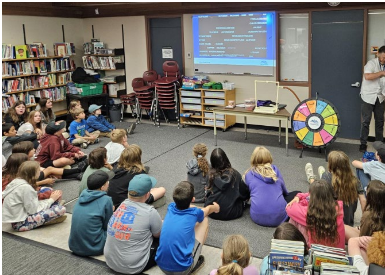
Island Health Presentation