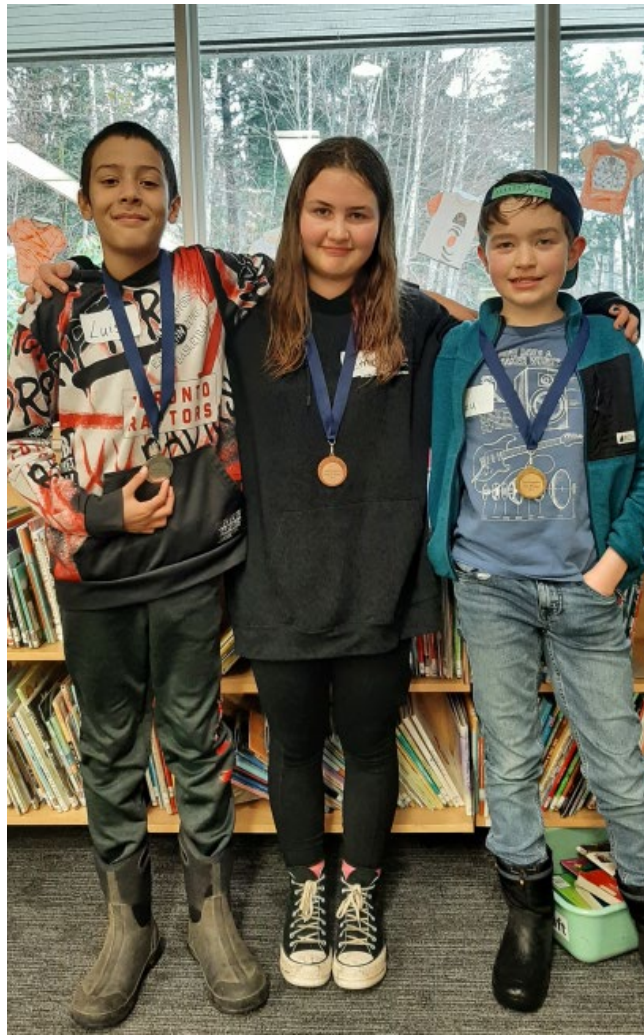
Spelling Bee Winners