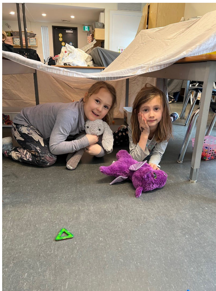
Kindergarten Reading Forts