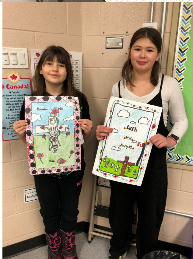
Remembrance Day Legion Poster Contest Winners