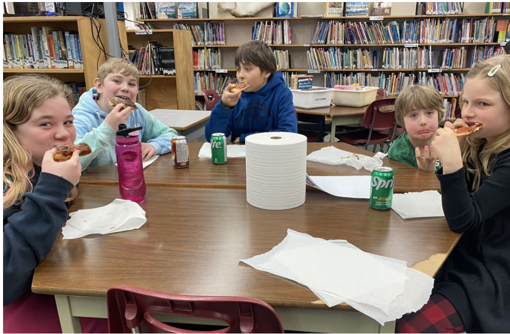
Pizza Lunch prize for completed Literacy Bingo cards