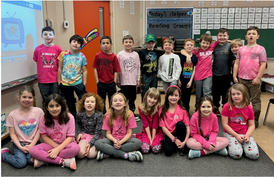
Pink Shirt Day