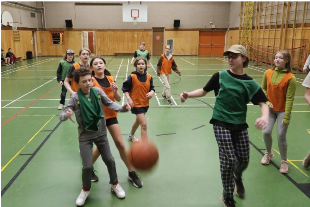
Mixed team basketball at lunch