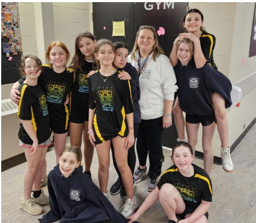
Girls Basketball team before their tournament