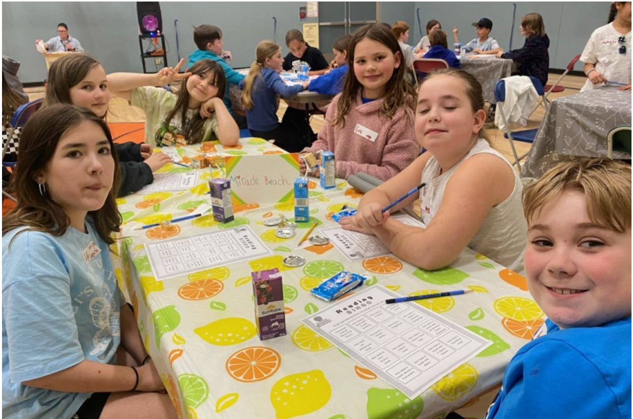
District Reading Link Challenge