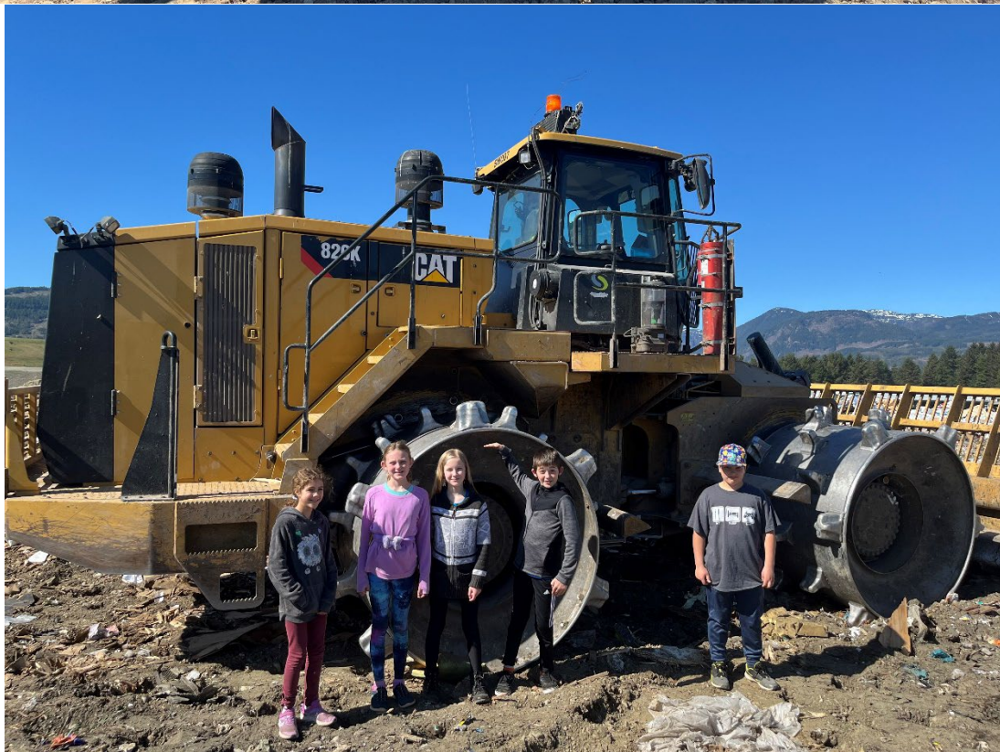
Waste Management Tour