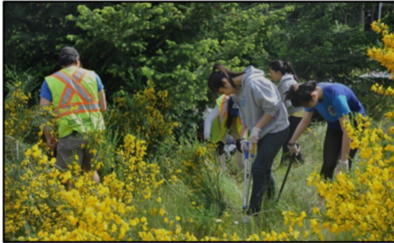
Pictured here, removal of Scotch Broom with loppers during blooming.

Since 2006 Broom Busters has been making a difference on Van Isle. This invasive plant is toxic to livestock, creates large monocultures that pose a fire hazard and threaten our natural resources. Healthy ecosystems equal healthy communities.