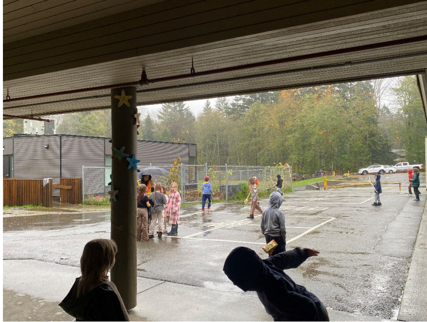
Rain? What rain?