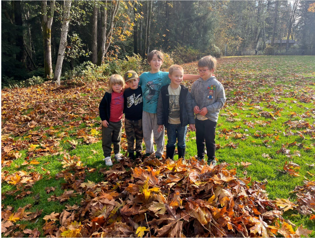
Fall fun with friends