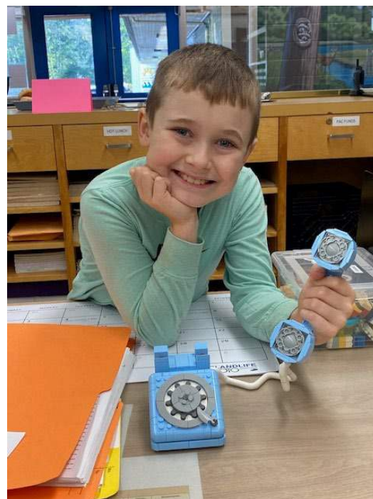
Just a kid and his LEGO rotary phone