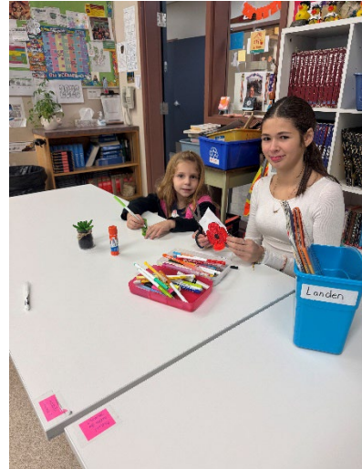
Grade 7 and Grade 1 buddies making poppies together