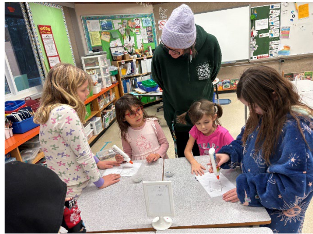
Big Buddies with Div 2 and Div 7