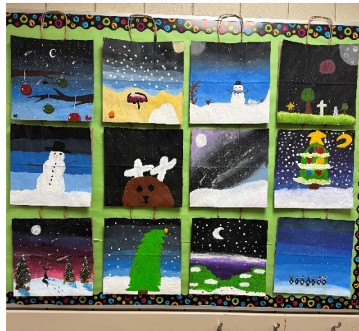
EDAS bags from Div 11 and Div 12