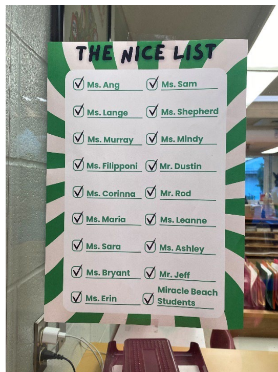
At least we know now who made the Nice List at the school!