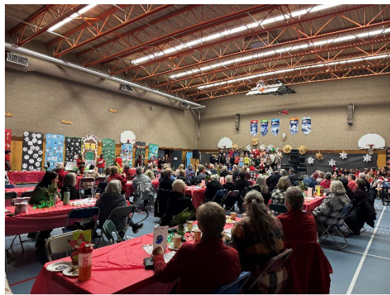
Our wonderful Senior's Tea, with our amazing Leadership students serving up the goodies!