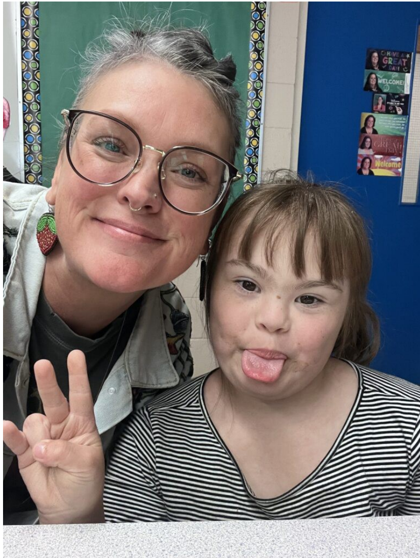
Miracle Beach Elementary