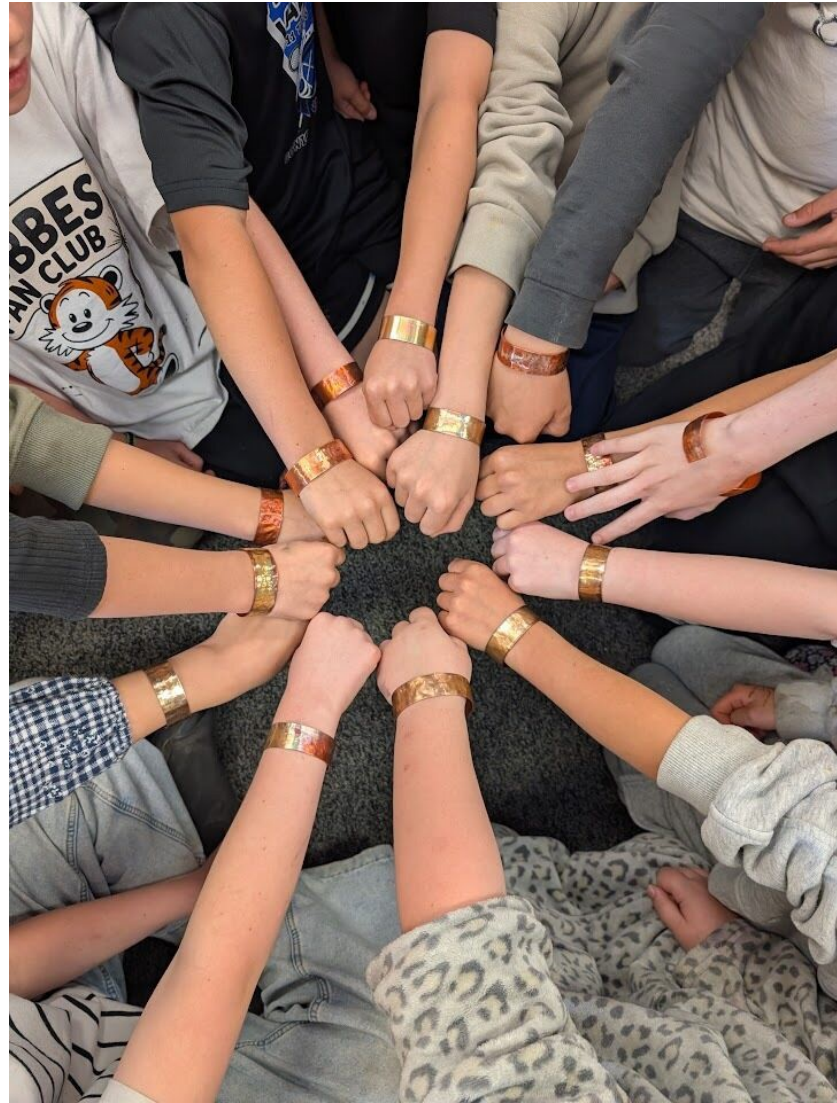
Vanier Band visit