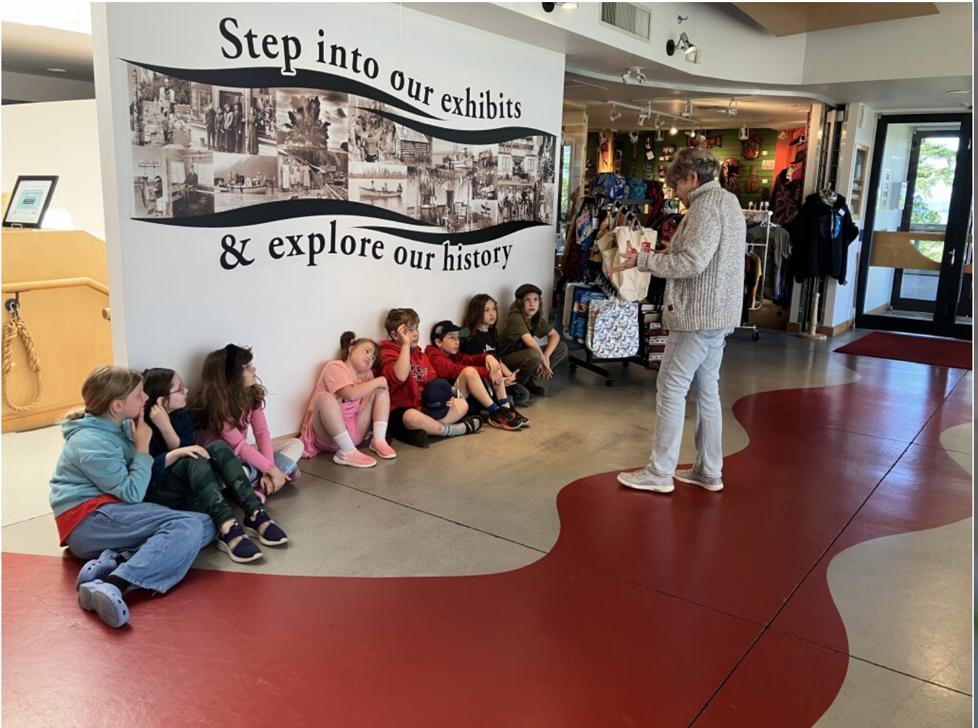
Miracle Beach Elementary