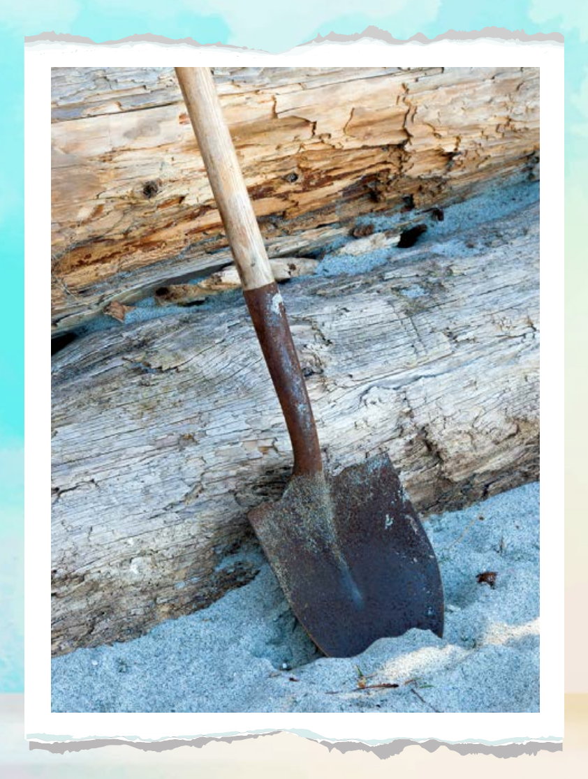
I spy a shovel in the sand.