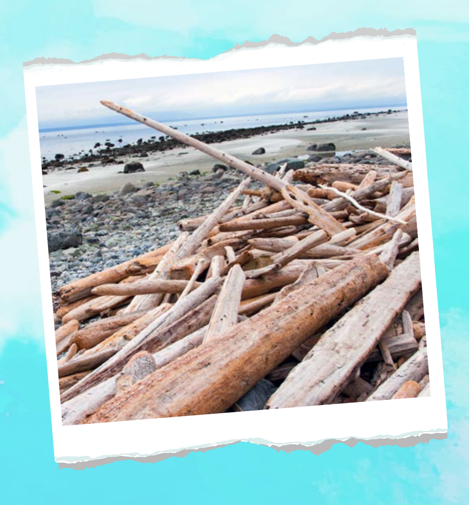
I spy driftwood on the beach.