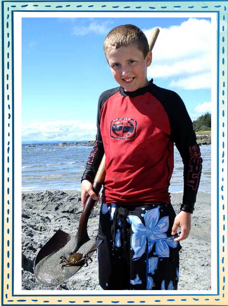
Look at the star crab!