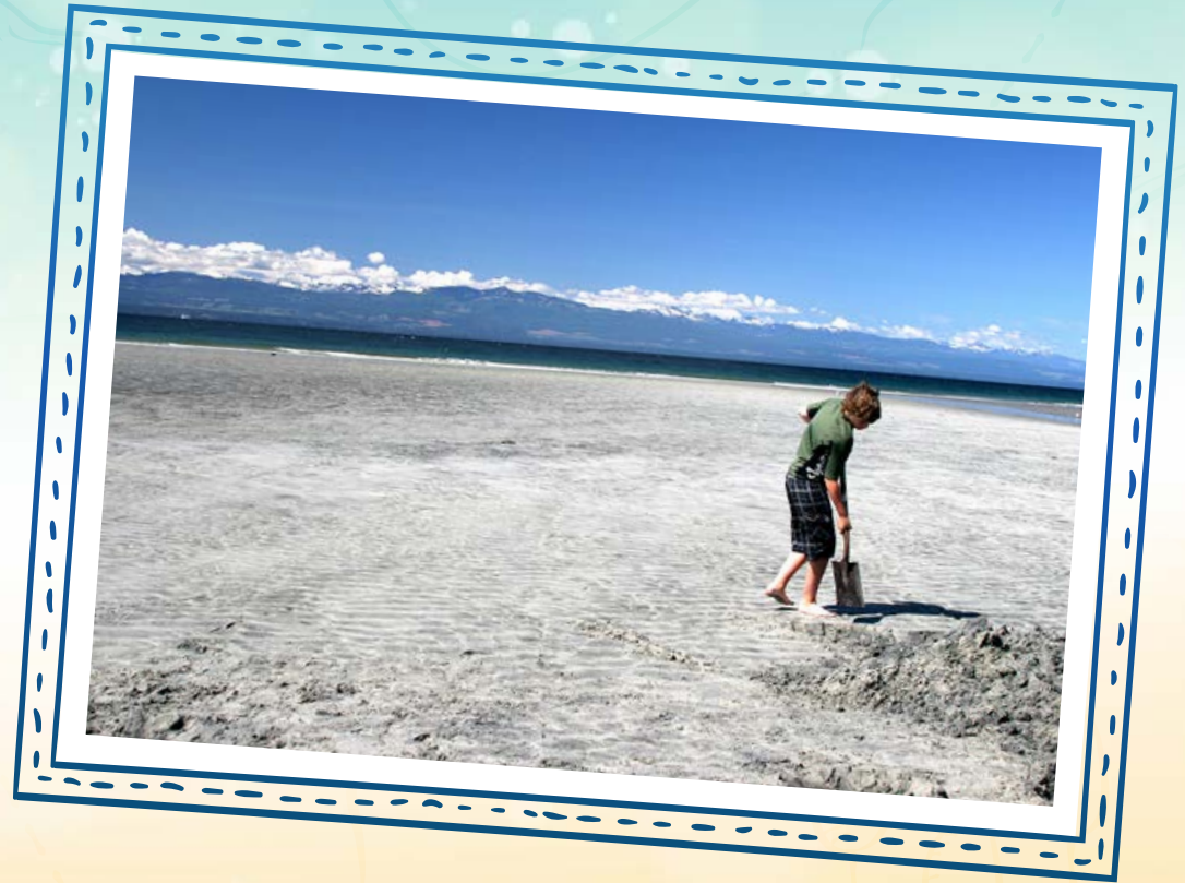
Noah digs a wall for the sand castle.