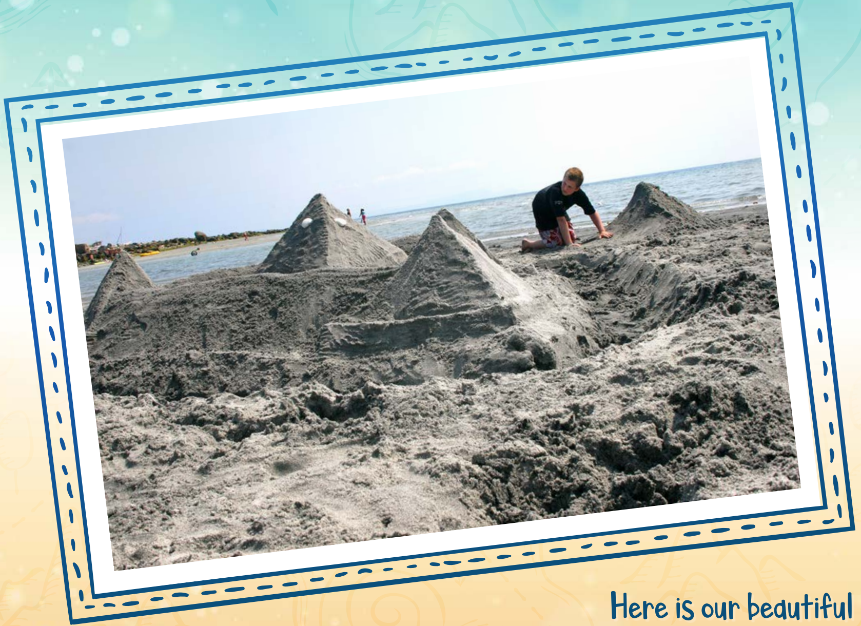
Here is our beautiful sand castle.