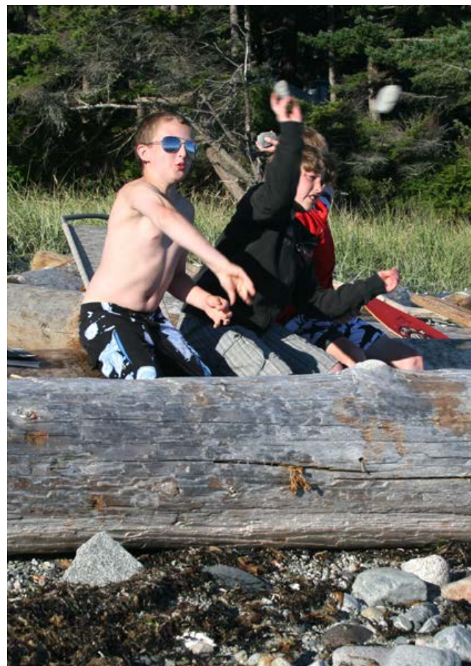
They throw rocks at the beach.