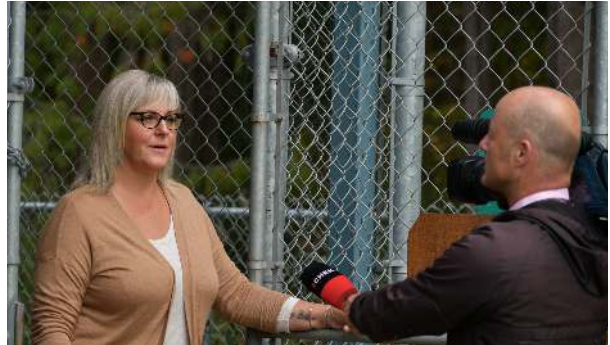
Full story details on Chek News