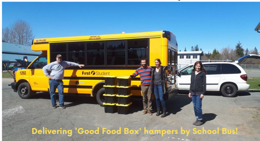
Delivering 'Good Food Box' hampers by School Bus!