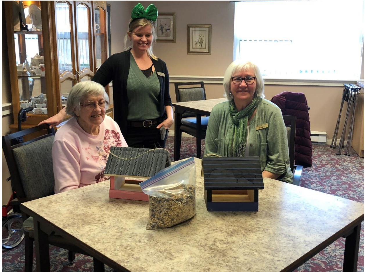
Stevenson Place Independent Living was one of seven facilities to receive student constructed bird feeders, a community outreach project at Lake Trail Community School using resources and material supplied by the District Career Department with the assistance from the Lake Trail Community Education Society (LTCES)