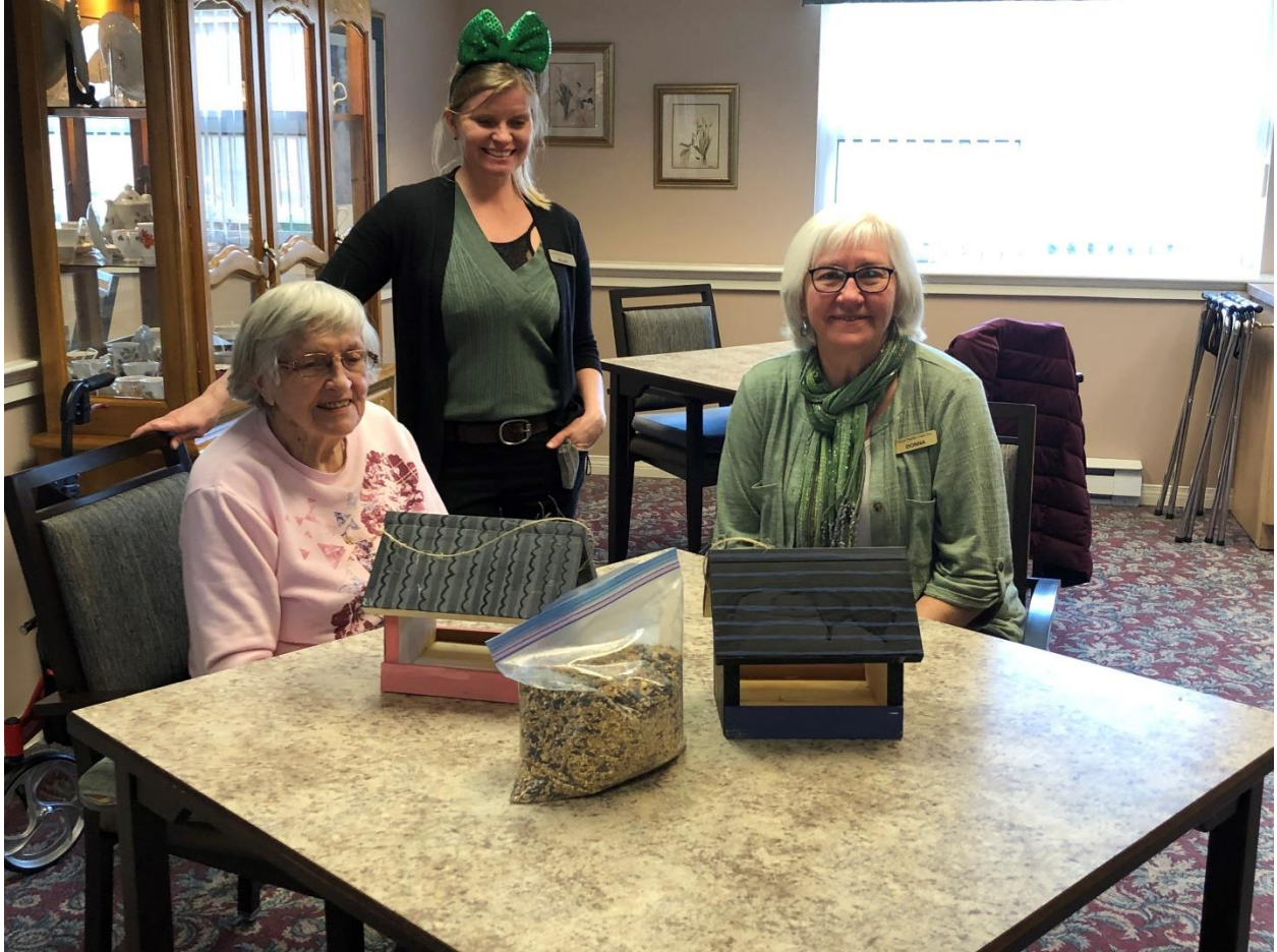
Stevenson Place Independent Living was one of seven facilities to receive student constructed bird feeders, a community outreach project at Lake Trail Community School using resources and material supplied by the District Career Department with the assistance from the Lake Trail Community Education Society (LTCES)