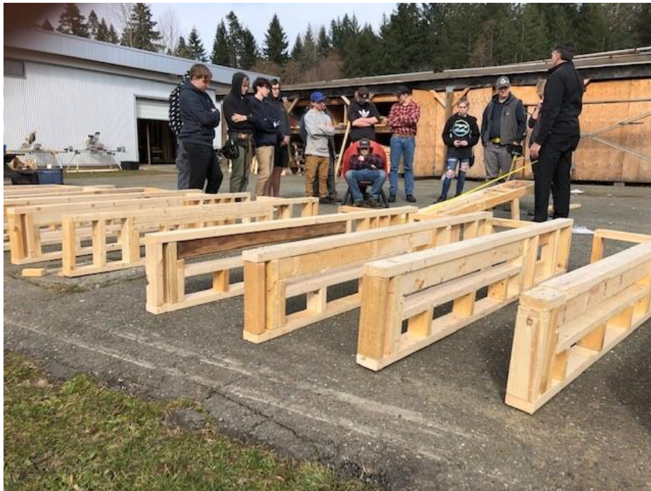
Carpentry Event students from Vanier, Highland and Isfeld watch as judges begin to measure their framing.