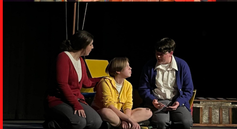
Above: Highland performs Concord Floral. Below: Vanier performs Yellow Boat