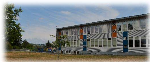
Figure 2 – Courtenay Elementary

Energy efficiency upgrades such as the controls at Courtenay Elementary and Glacier View Secondary will simplify operational processes and allow for system automation and energy efficiency in the workplace. Controls are a key component to optimizing HVAC efficiency, aiding in reducing energy waste , reducing energy consumption, and increasing equipment and system efficiency.