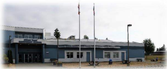
Figure 5 – Aspen Elementary