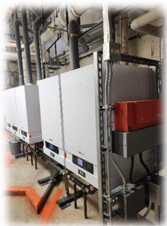
Figure 1 – New condensing boilers at NIDES

Natural Gas is and has been a dominant, low-cost energy source for buildings. Roughly, 80% of SD71 buildings have fuel heating. Natural gas and propane have much higher