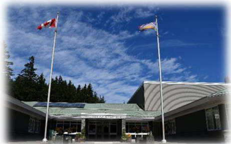
Figure 8 – Huband Park Elementary

Along with accounting for GHG emissions, SD71 is preparing for a changing climate and managing climate related risks. Comox Valley Schools incorporates climate risk management