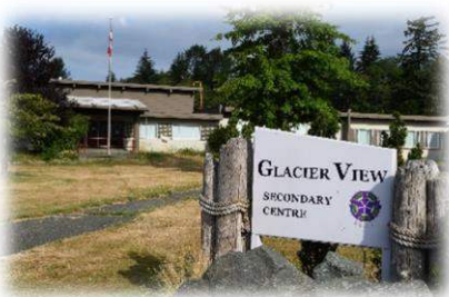
Figure 7 – Glacier View Secondary

Ongoing light-emitting diode (LED) lighting upgrades were completed in various school