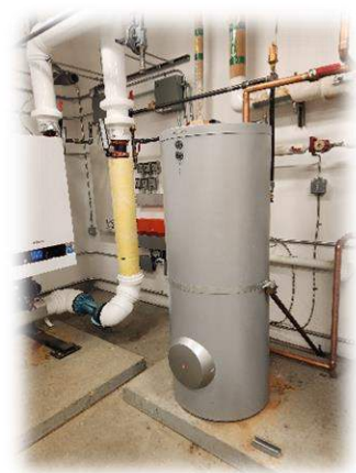
Figure 4 – New Queneesh indirect water heater

central heating system now does all the work; the indirect heater simply facilitates heat transfer from the boiler.