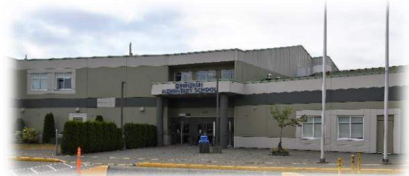
Figure 6 – Queneesh Elementary

Ongoing light-emitting diode (LED) lighting upgrades were completed in various school