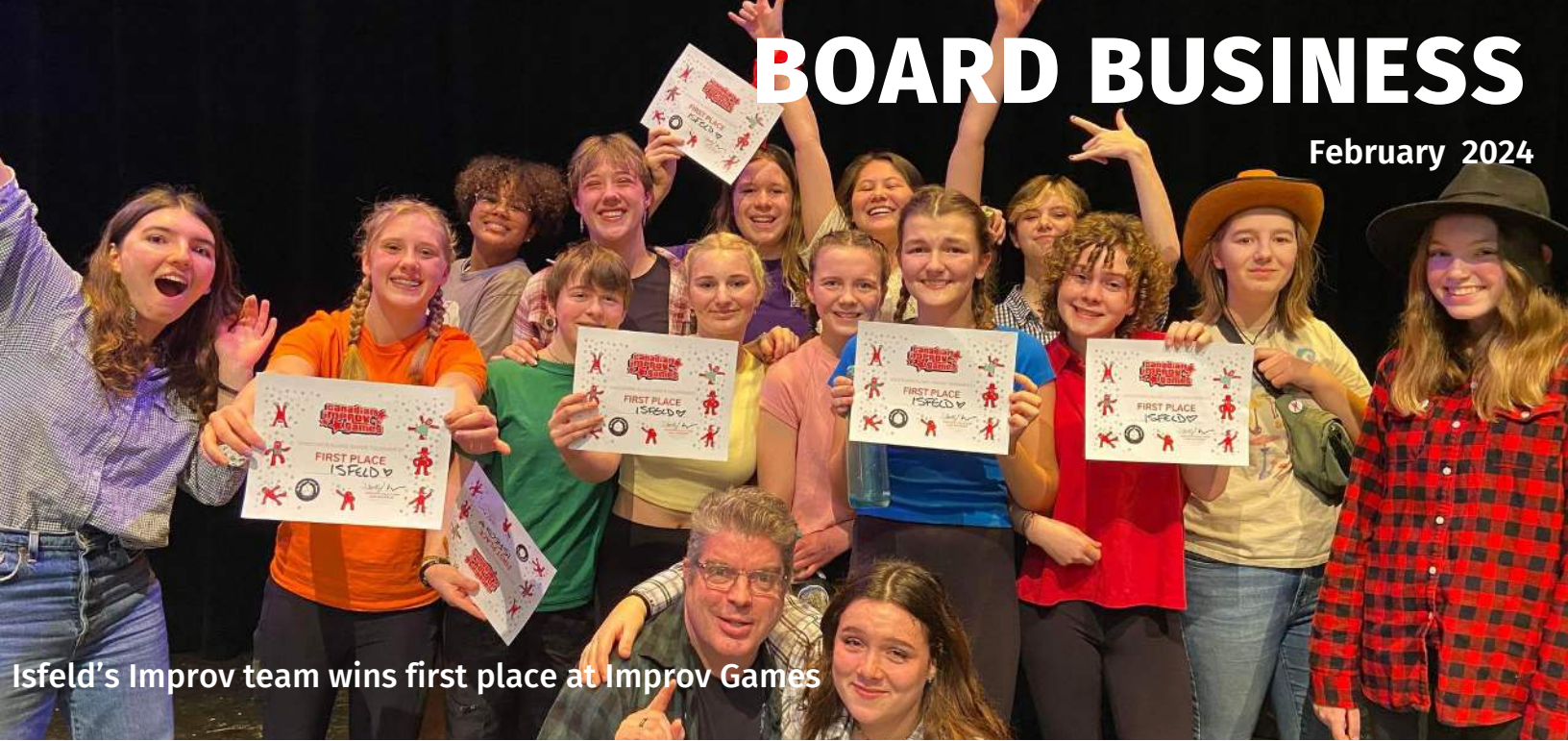
Isfeld's Improv team wins first place at Improv Games