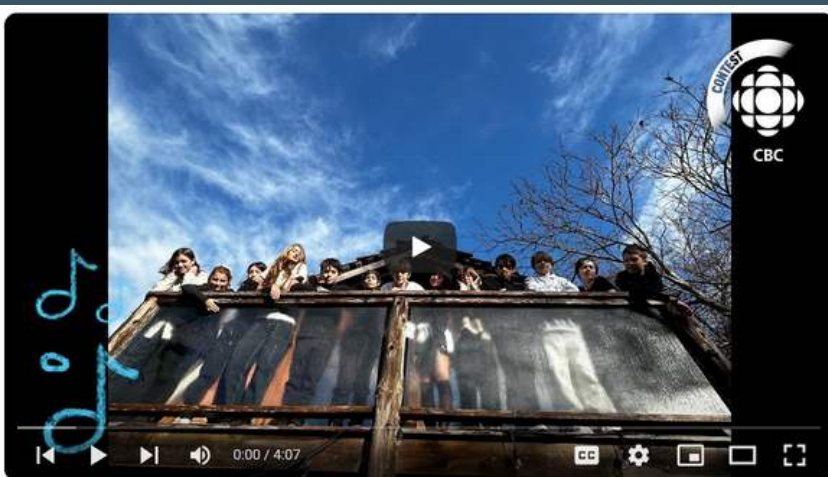
"The Returner" - Hornby Island Community School #cbcmusicclass