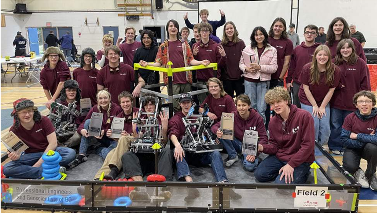
Robotics 71 team photo