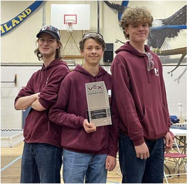
Team-F: Excellence Award Winners