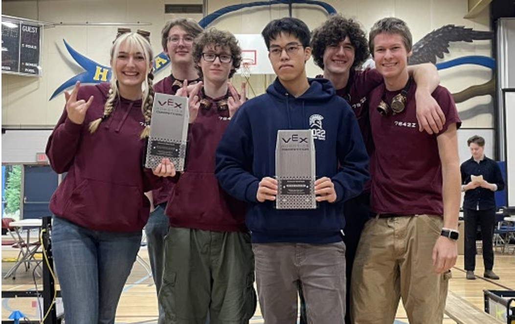
Team-Z: Tournament Champions & Innovate Award Winners with alliance partner 1022-R