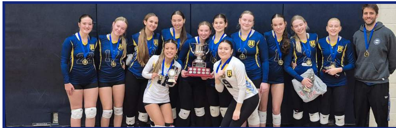
Pictured: Highland Secondary 2A Girls Island Champions

Six volleyball teams have qualified for provincials, with the Highland Senior Girls going unbeaten in playoff volleyball this season and capturing the 2A Island Championship in remarkable fashion. In AAA play, the G.P. Vanier Senior Boys captured their first Island title since 2009. Four other team also qualified for the provincials. Congratulations to everyone involved! More details are below in the news.